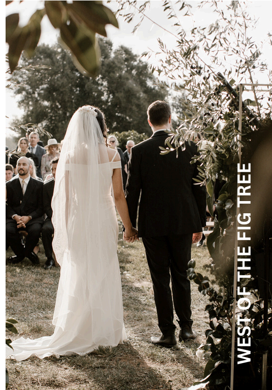
WEST OF THE FIG TREE