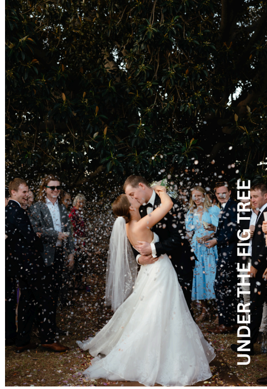
UNDER THE FIG TREE