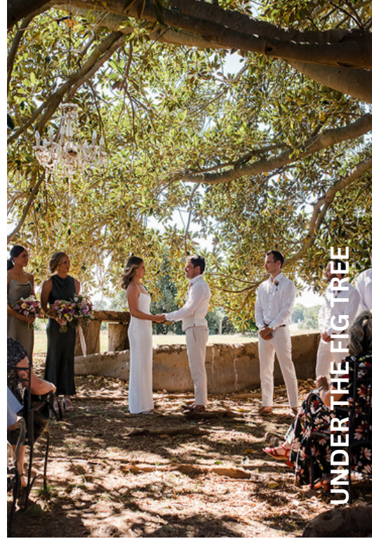
UNDER THE FIG TREE