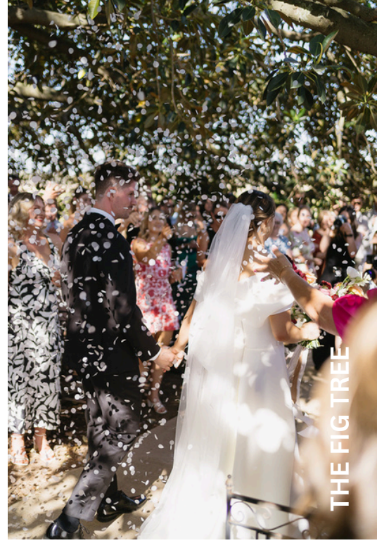
THE FIG TREE