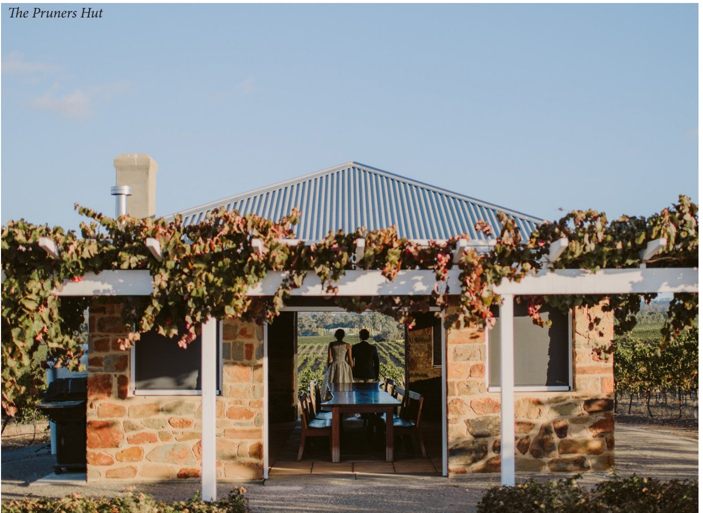
The Pruners Hut

20 x white Americana chairs, plus 2 x additional chairs & round table (for signing marriage certificate)