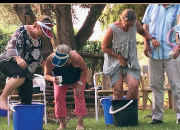
Grape stomping competition