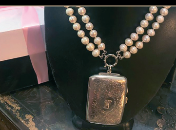
Lucky door prize necklace donated by Panda Pearls