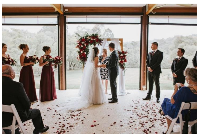
Ceremony in Function Pavilion photo by Kendra Benson Photography.