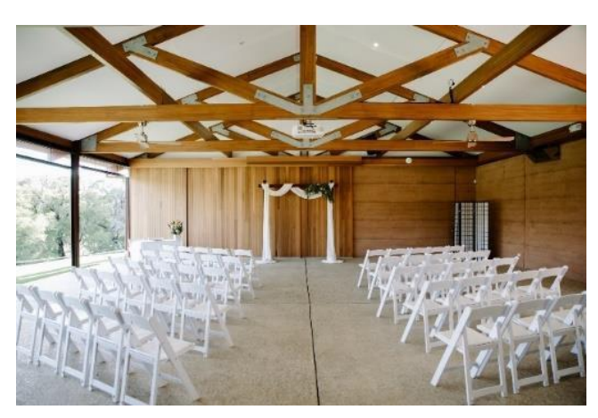
St Aidan Function Pavilion Ceremony.

*More chairs, Food and Drink Service and other sundries available on request at additional charge. *Please note: if you choose to have your reception with us, the ceremony fee is waived.