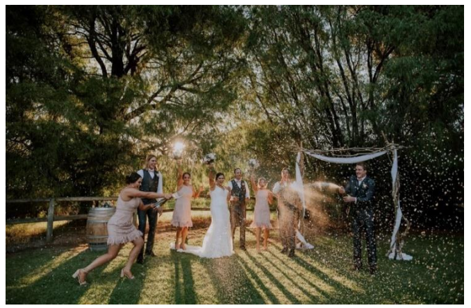
St Aidan lawn

Please take the time to read through this agreement and do not hesitate to get in touch with any questions.