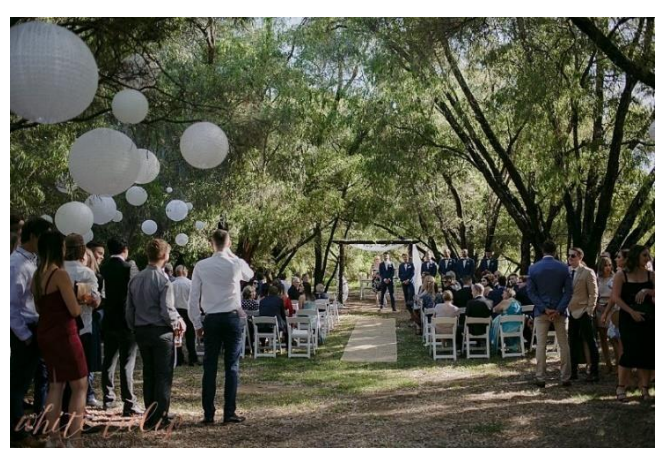
Picnic area taken by Mandy Bowler Photography.