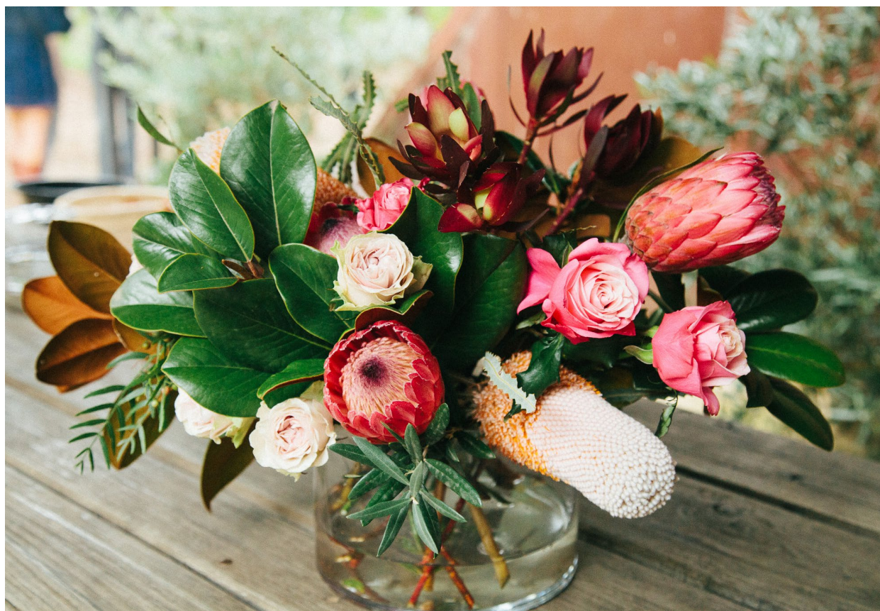
Sample barrel arrangement