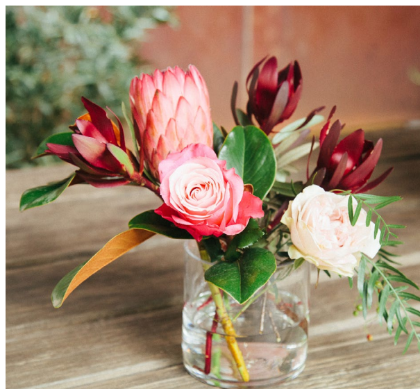
Sample table arrangement

Choose from the below options. Some variations to florals and colour palettes can be made at an additional cost.