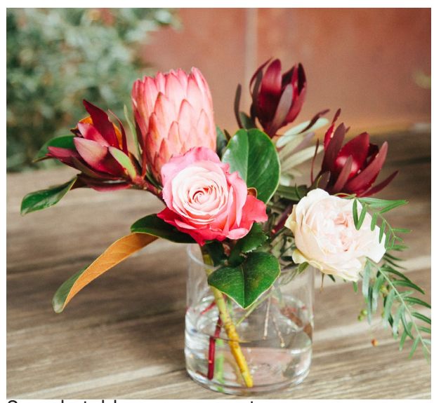
Sample table arrangement