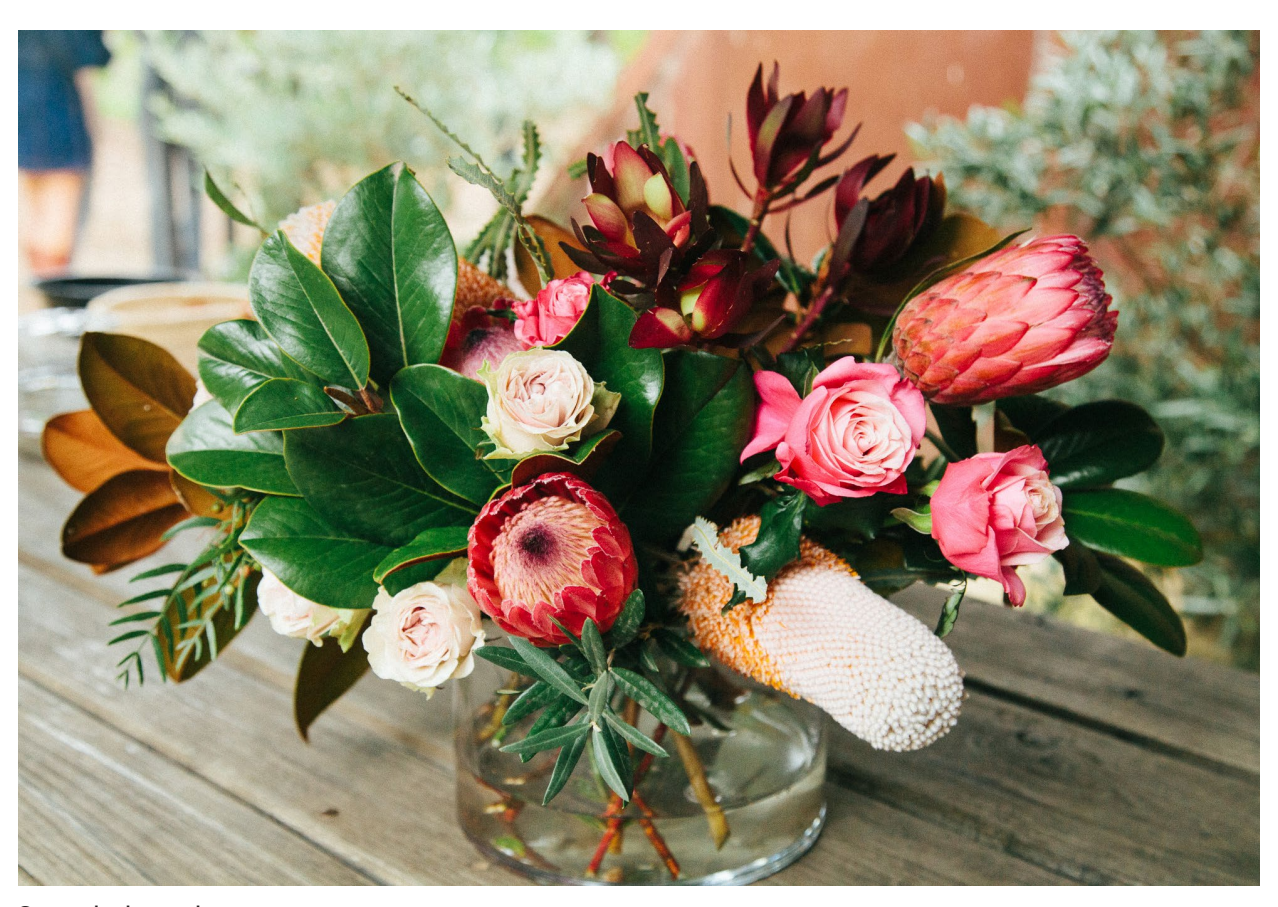
Sample barrel arrangement