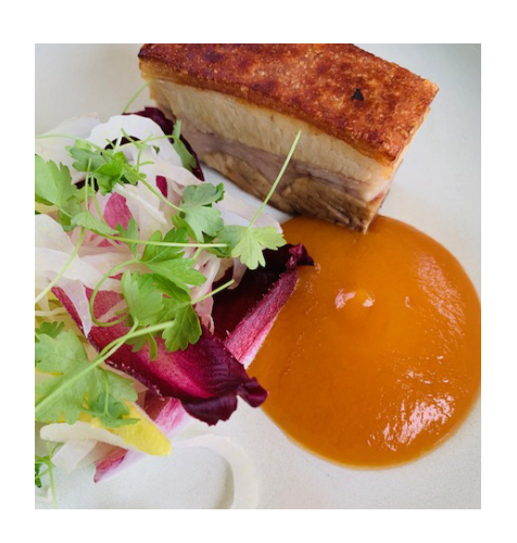
Canapes + two course plated $85 / including five hour beverage package $150

Canapes + three course plated $97 / including five hour beverage package $162