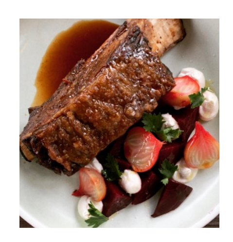
/ including five hour beverage package $155