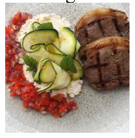
Three course shared $100

/ including five hour beverage package $170