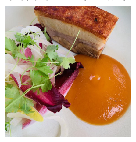
Canapes + three course plated $115 / including five hour beverage package $185