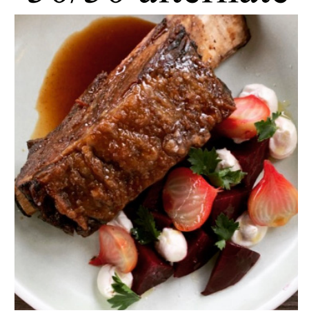
Canapes + two course plated $105/ including five hour beverage package $175